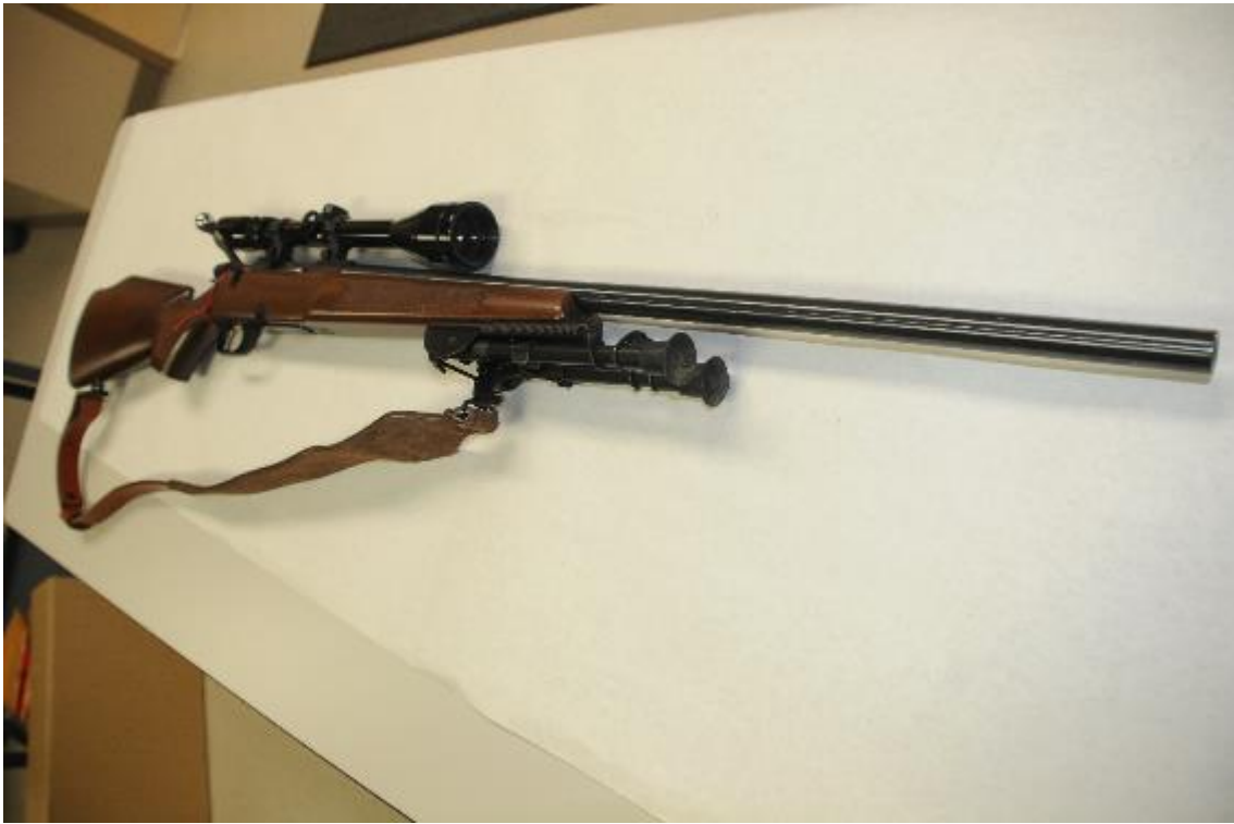
Item 1: Tikka, Model M-595, .17 Remington Caliber Rifle, Serial No. 253874