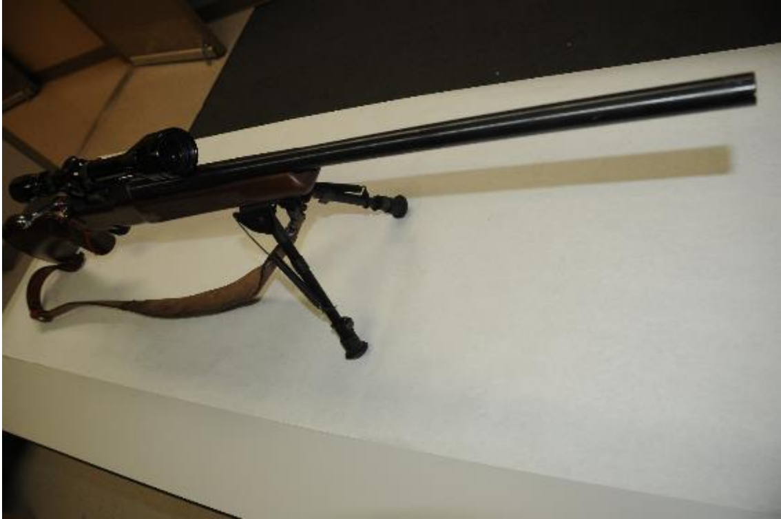
Item 2: Winchester, Model 70, .223 Caliber Rifle, Serial No. G2002884