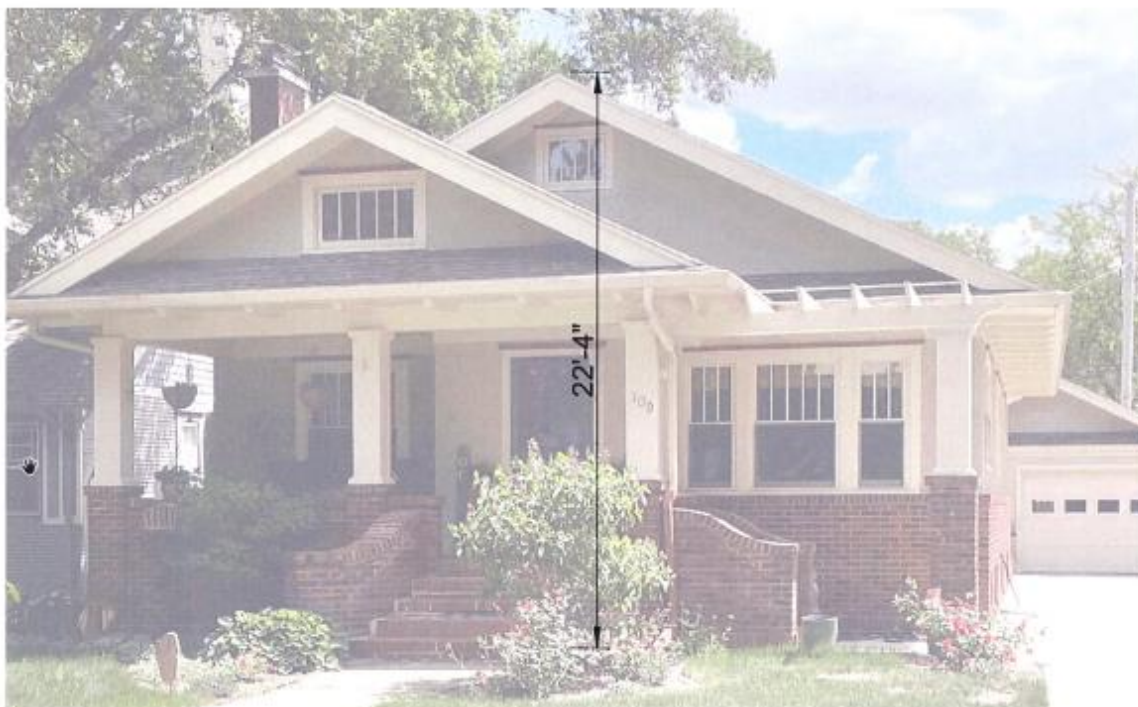
Proposed Addition Roof Height of property at 707 E. 21 st Street: 24'-5"