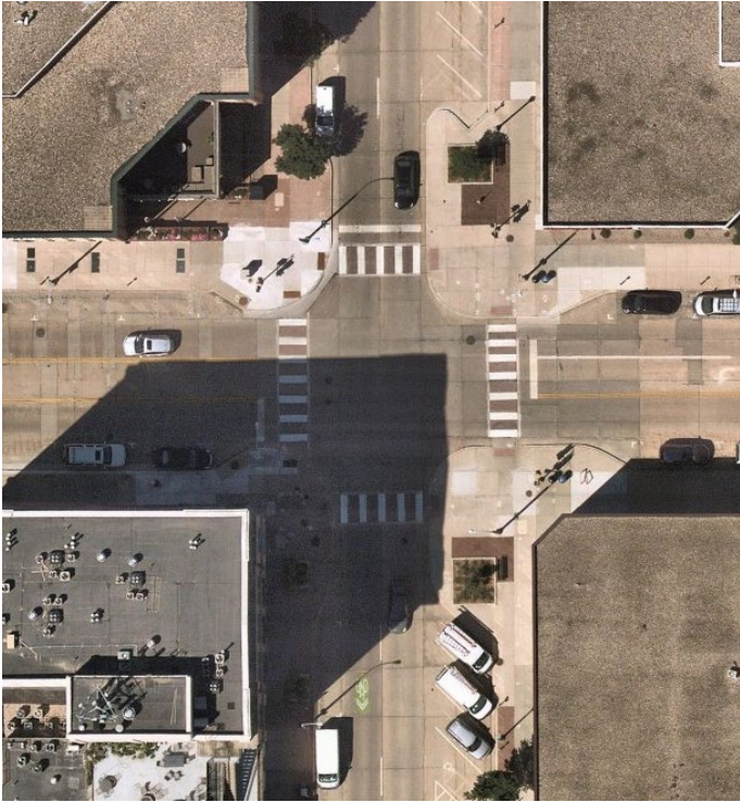
9 th and Main