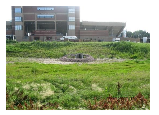
Regional BMP Construction Update on construction of regional detention facilities and other important BMPs