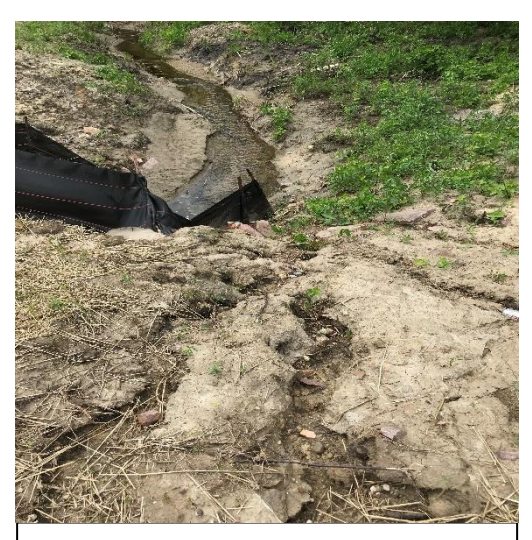
Slope too steep for PAM-12 application

The City of Sioux Falls would like to make the announcement discouraging the use of PAM-12 on any slopes greater than 5:1. Past experience within the city has proven that Pam-12 is ineffective in most cases when applied to any slopes steeper than the mentioned 5:1. It may still work as a tacking agent for mulch, but it should not be used on its own. If the use of PAM-12 is suggested by any developers or builders in the area, then it will be reviewed on a case-by-case basis to ensure it is being used in the most beneficial way possible. PAM-12 has been proven to underperform without being used in conjunction with other surface stabilizing methods due to the nature of the weather in this region.