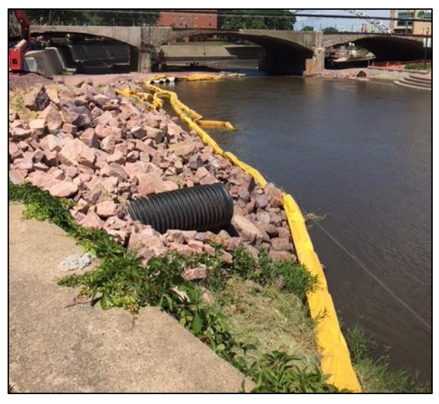
8<sup>th</sup> Street Bridge Rehabilitation

A temporary access road was constructed and the slope was reinforced with large riprap, curtailing the possibility of erosion. Adding silt curtain as pictured helped to further contain any particulates.