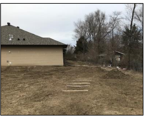
Importance of MGE A reminder of the need to ensure minimum ground elevations are met.