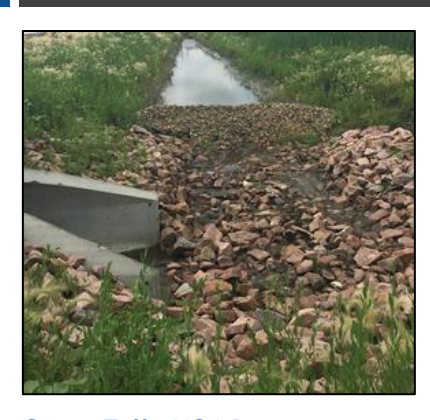
Sioux Falls MS4 Permit

Sediment basins and traps are important BMP's to implement while a site is under construction. needed They provide much treatment of stormwater runoff impacted by debris and sediment. weather Many of these temporary controls