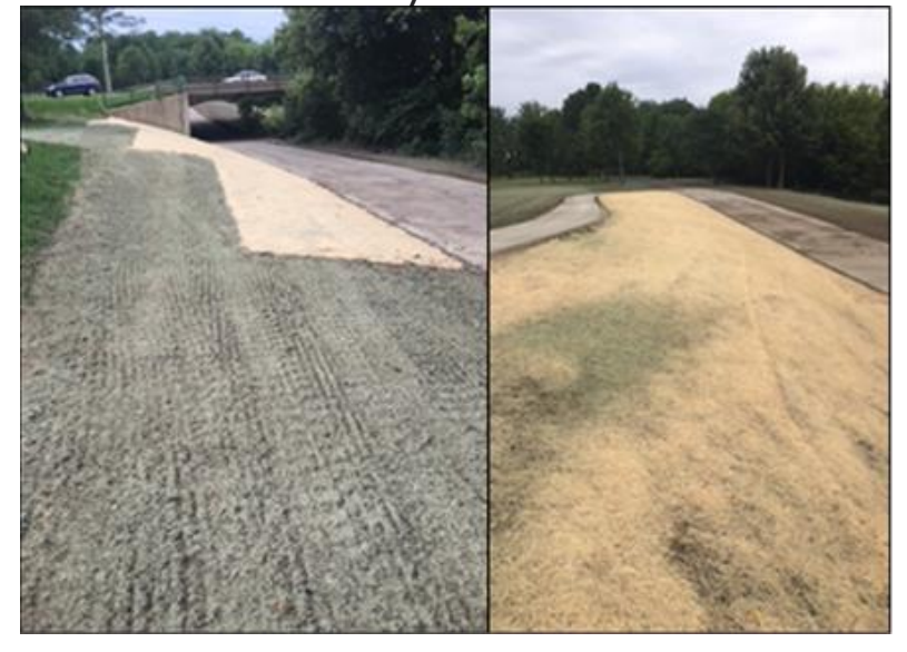
Beadle and Cherry Rock Park Bike Trail

Drill lines in the left photo will provide good roughness to impede erosion while the proper hydromulch thickness was applied. The steeper slope to the right was covered with a woven blanket to provide good slope protection and integrity while vegetation works to take hold.