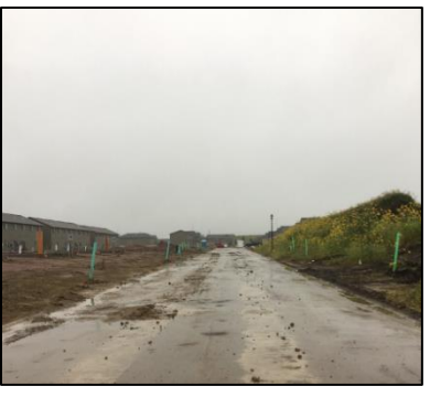
What Constitutes an Illicit Discharge? Learn about what an illicit discharge is and what the different forms can be.