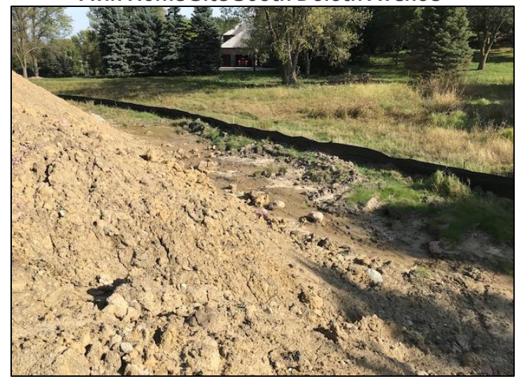
Twin Home Site South Duluth Avenue

Silt fence and sediment traps in sequence were utilized at this site. One trap upstream of the pictured area helps lessen the load on the far trap and properly installed silt fence.