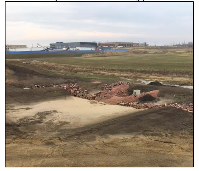
Jans Corp. Warehouse West 54th ST N

Two building sites on W 54<sup>th</sup> ST N shared a well-built sediment basin. The picture shows how effectively a well-built sediment basin holds back sediment and other particulates during a storm event.