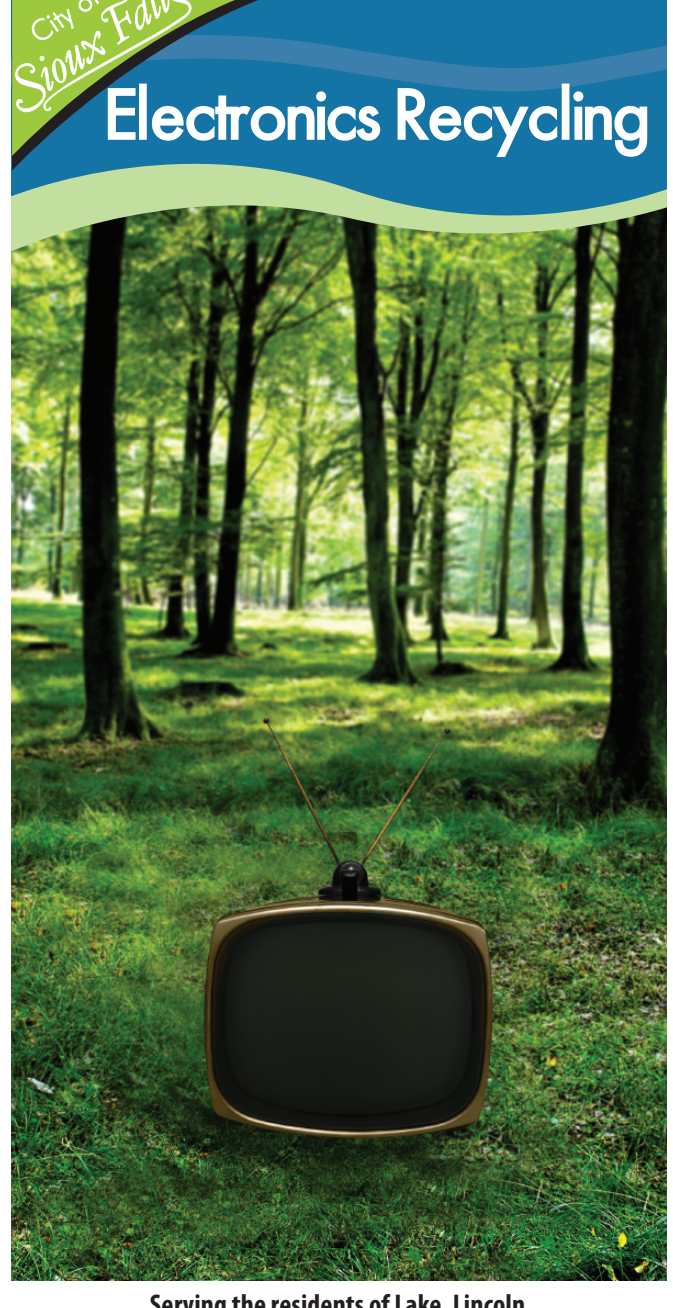
Serving the residents of Lake, Lincoln, McCook, Minnehaha, and Turner Counties.